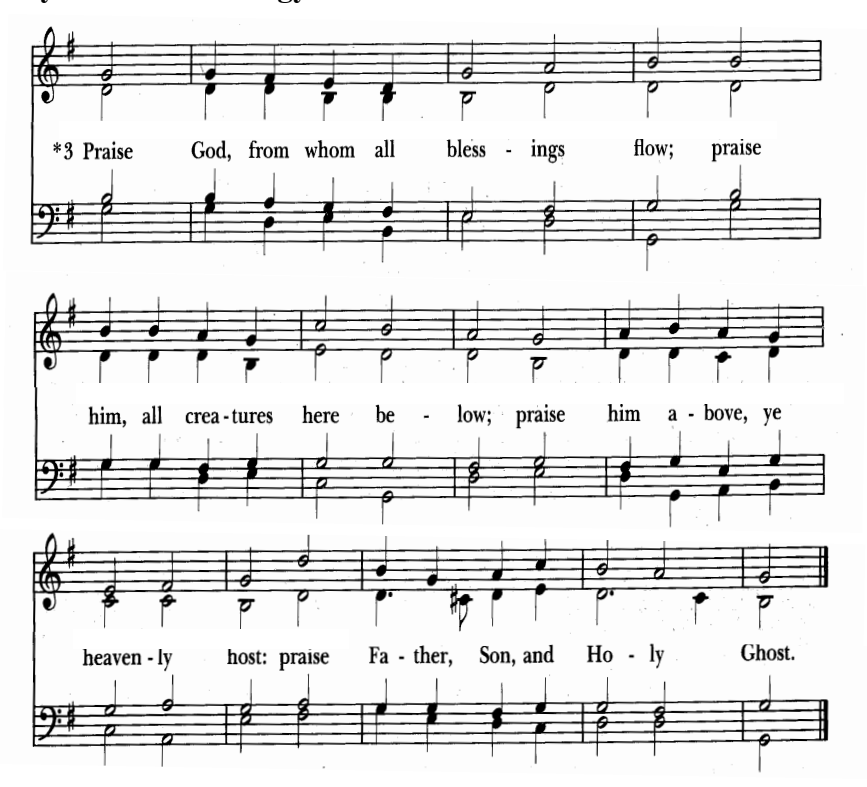
The Great Thanksgiving – Eucharistic Prayer B

Celebrant The Lord be with you. People And also with you. Celebrant Lift up your hearts. People We lift them to the Lord.