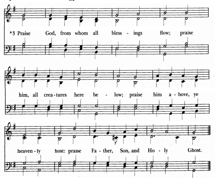
The Great Thanksgiving – Eucharistic Prayer A

Celebrant The Lord be with you. People And also with you. Celebrant Lift up your hearts. People We lift them to the Lord.